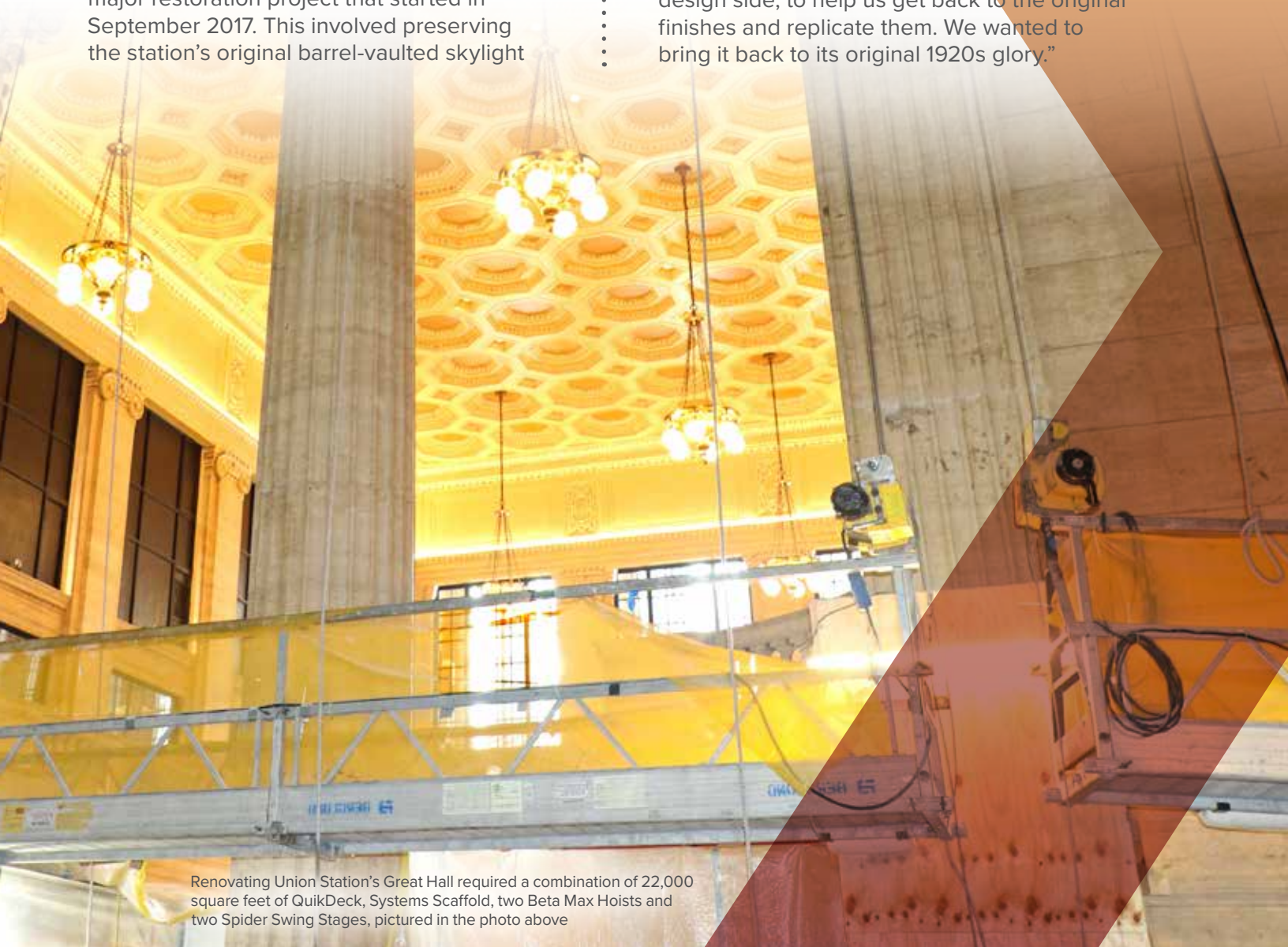
Renovating Union Station's Great Hall required a combination of 22,000 square feet of QuikDeck, Systems Scaffold, two Beta Max Hoists and two Spider Swing Stages, pictured in the photo above