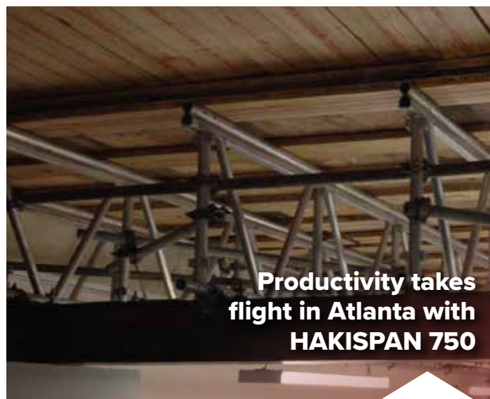
Productivity takes flight in Atlanta with HAKISPAN 750